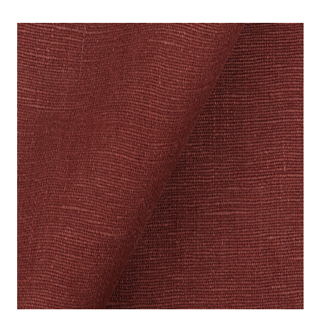
FS Colour Series: AUBURN Inspired by Georgia O'Keeffe's Rust Red