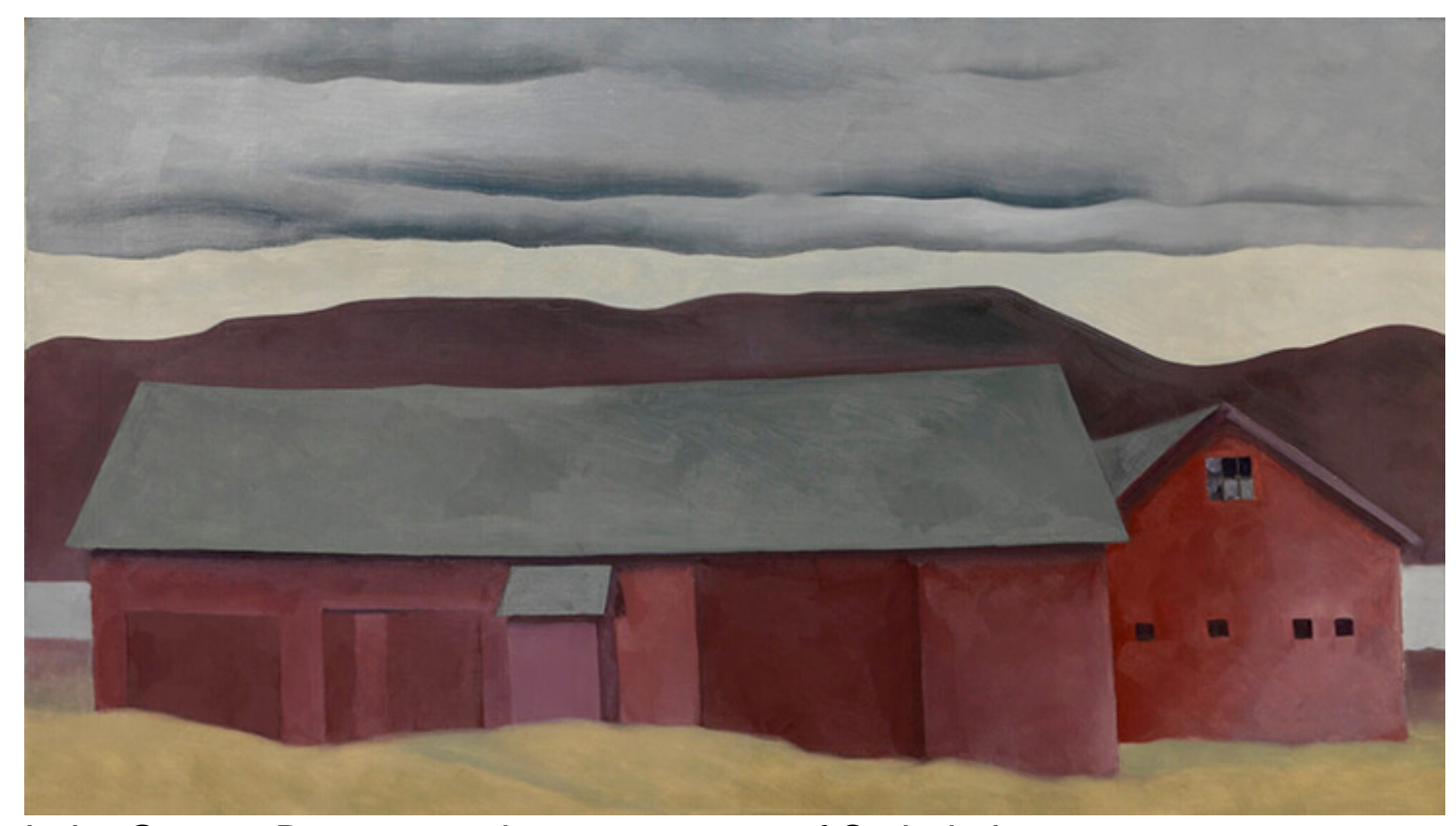
Lake George Barn, 1929, image courtesy of Sotheby's

Warm rust reds like <u>AUBURN Linen</u> tinged many of Georgia O'Keeffe's most famous paintings, invoking dry autumn leaves, worn out buildings or the barren wilderness of old America. O'Keeffe was one of the most pioneering